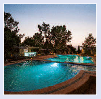
Petrino Suites Bed & Breakfast, Afitos

For more information please see our website.