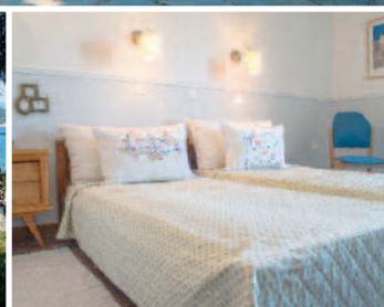
View from Liotopi Hotel