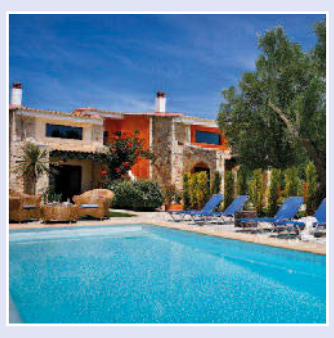
Nefeli Villas & Suites Self Catering, Nea Skioni (Kassandra)

For more information please see our website.