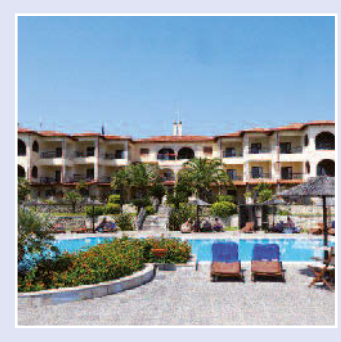
Blue Bay Hotel Bed & Breakfast, Afitos

For more information please see our website.