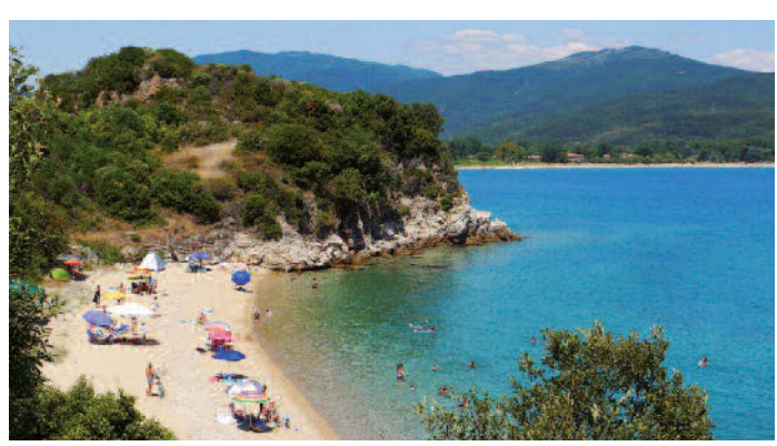
Stagira Beach, Olymbiada

For further information and an idea of local cost please see our website.